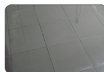
Step 5: Rinse thoroughly with clean water.

Note A: For heavy wax coatings, see PROBLEM SOLVER #7A - REMOVE HEAVY PORCELAIN WAX