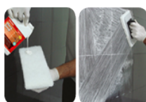
Note: For walls, apply product direct to white pad then scrub surface.