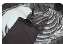
Step 4: Remove dirty solution. A wet/dry vac may be used.