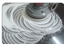
Step 3 Large areas use a low speed scrubbing machine with white pad.